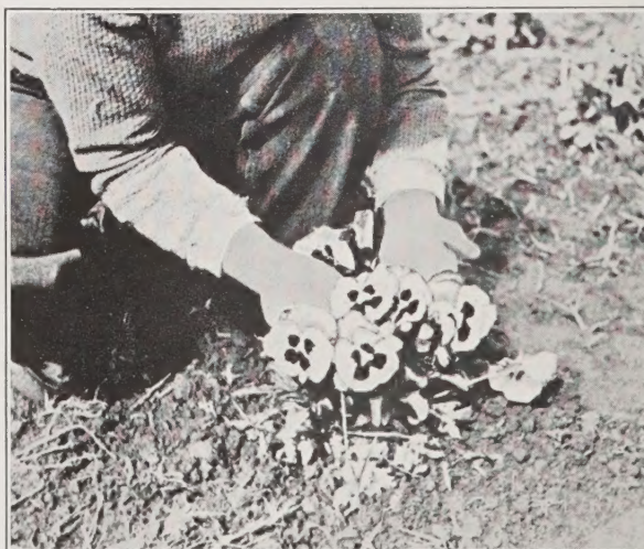
HARROLD'S PANSIES are noted for their ability to produce the largest flowers on desirable, compact plants. The color range has never been surpassed.

PANSY NOVELTIES Continued in next column.